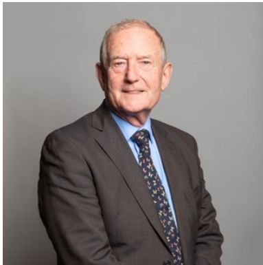
Barry Sheerman , Member of Parliament for Huddersfield at House of Commons